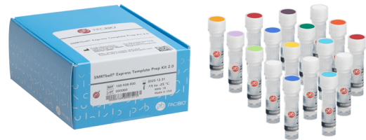
Figure 1. SMRTbell Express Template Prep Kit 2.0 (PN 100-938-900)

This product note highlights the key benefits, performance, and resources available for obtaining complete microbial genome assemblies with multiplexed sequencing. By using a single-tube, addition-only strategy, the streamlined workflow reduces the number of AMPure clean-up steps. This provides an opportunity to explore automation solutions for high-volume projects, while using as little as 1 µg of input DNA.